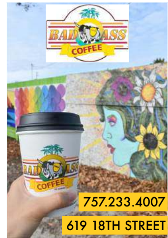
757.233.4007 619 18TH STREET