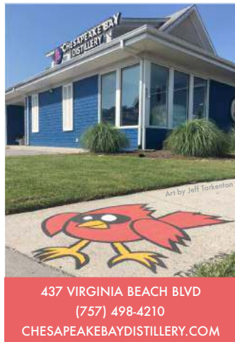
437 VIRGINIA BEACH BLVD (757) 498-4210 CHESAPEAKEBAYDISTILLERY.COM