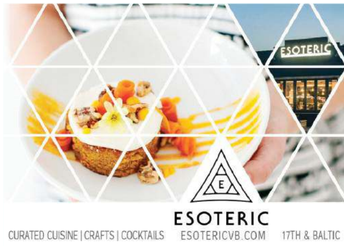
ESOTERIC CURATED CUISINE | CRAFTS | COCKTAILS ESOTERICVB.COM 17TH & BALTIC