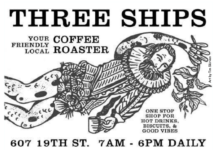
ONE STOP SHOP FOR HOT DRINKS, BISCUITS, & GOOD VIBES 607 19TH ST. 7AM - 6PM DAILY