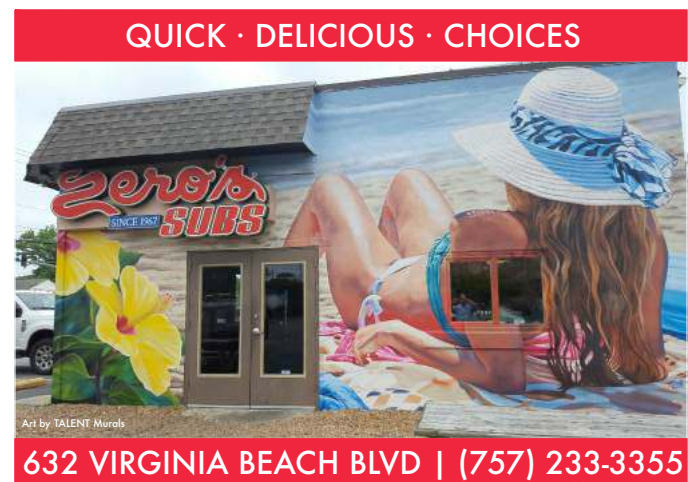
QUICK · DELICIOUS · CHOICES 632 VIRGINIA BEACH BLVD | (757) 233-3355