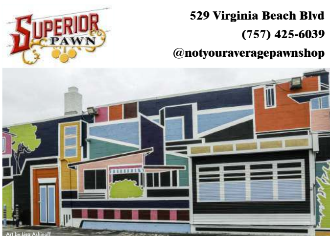
529 Virginia Beach Blvd (757) 425-6039 @notyouraveragepawnshop

Weekly and monthly events like First Fridays and Second Saturdays, the Old Beach Farmers Market, and VB Flea give a taste of the town, bring fun and entertainment, and provide an authentic neighborhood experience. Check out our website or follow us on social media for current updates. There is never a dull moment. So go beyond the boardwalk and create the ViBe.