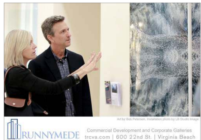
Commercial Development and Corporate Galleries trcva.com | 600 22nd St. | Virginia Beach