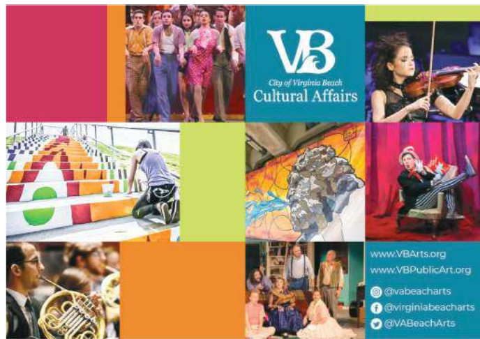
City of Virginia Beach Cultural Affairs www.VBArts.org www.VBPublicArt.org @vabeacharts @virginia-beacharts @VABeachArts