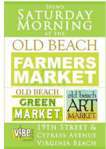
19TH STREET & CYPRESS AVENUE VIRGINIA BEACH