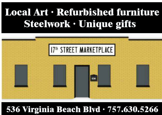
536 Virginia Beach Blvd · 757.630.5266