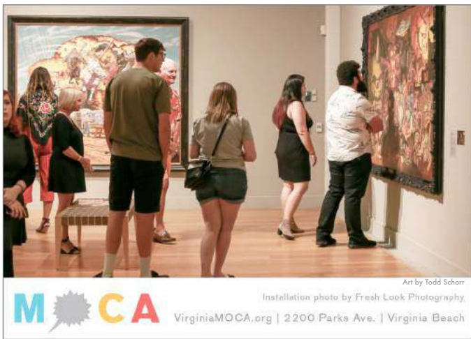
Art by Todd Schorr VirginiaMOCA.org | 2200 Parks Ave. | Virginia Beach