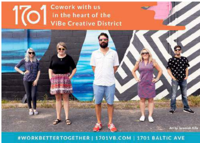
#WORKBETTERTOGETHER | 1701VB.COM | 1701 BALTIC AVE

Nestled within the Oceanfront area. Virginia Beach's own cultural arts enclave - the ViBe Creative District. A hub for over 100 artists and creative businesses - including spirits, roasters and restaurants, workouts and wares, museums and more - the ViBe is where our creative businesses have set up shop to share their passion and inspire a sense of discovery in locals and visitors alike. Virginia Beach's first arts district is anchored by the Virginia Museum of Contemporary Art (MOCA) and has artisanal shops, art studios, vintage boutiques, luxury and antique furnishing specialists, a variety of culinary arts, and even a local craft distillery. Whether you're here for a few days or here for good, there's always something special going on.