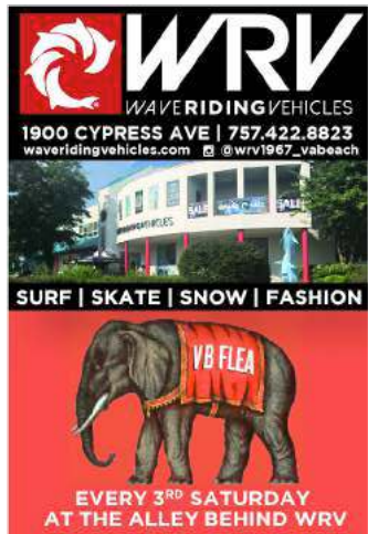
1900 CYPRESS AVE | 757.422.8923 waveridingvehicles.com @wrv1967_vabeach SURF | SKATE | SNOW | FASHION EVERY 3RD SATURDAY AT THE ALLEY BEHIND WRV